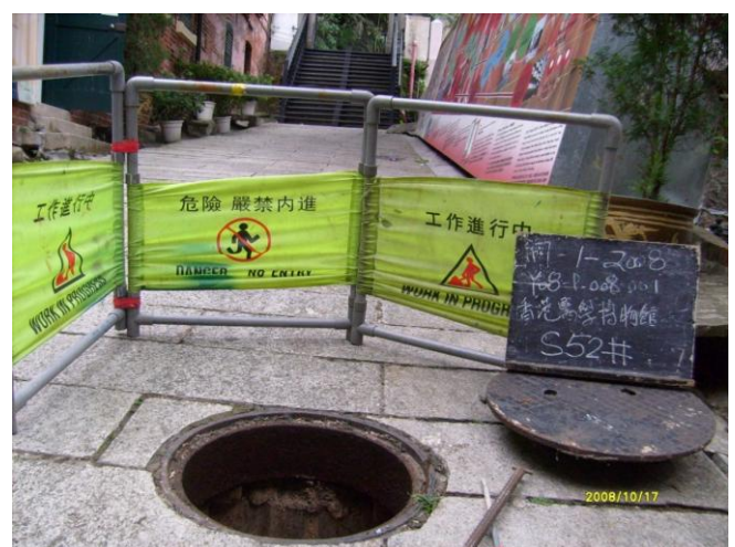
Fig. 2 Manhole location photo 圖二. 沙井位置相片