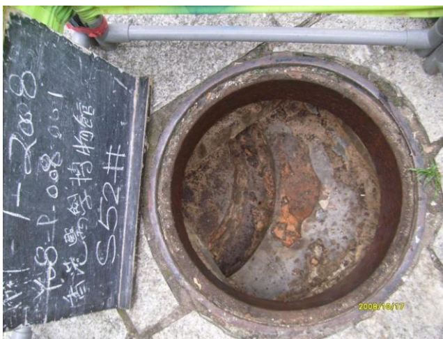
Fig.3 Manhole internal photo 圖三. 沙井內部相片